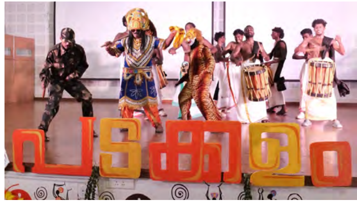
A vibrant moment from the Onam celebrations organized by the Student Union on August 27, 2025, bringing the spirit of festivity to the campus.