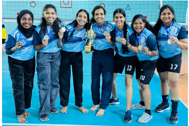
Kerala Women's Senior Team secured the Runner-up position in the 27th National Deaf Senior Volleyball Championship 2025-26, held at Nadiad, Gujarat, from 29th August to 1st September 2025. It is a matter of great pride that 7 students from NISH were part of the team and contributed to this remarkable achievement. Heartfelt congratulations to our students on this commendable success.