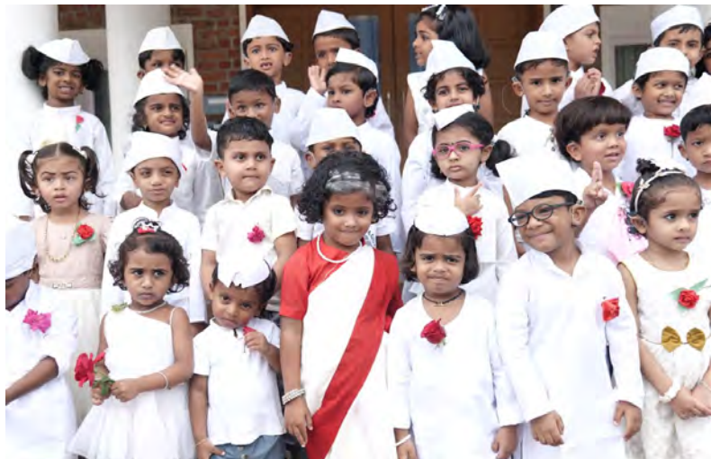
Early Intervention Program (EIP) little ones celebrating Children's Day with bright smiles and big hearts at NISH.