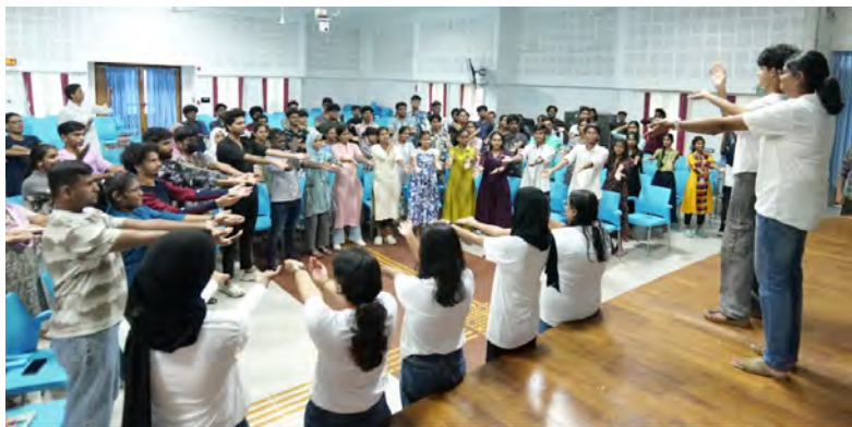
Degree (HI) students attended an impactful session by 'Let's Live' on November 18, 2025. Designed to foster a supportive environment, the program emphasized open conversations and peer-to-peer support to build resilience and challenge the stigma surrounding mental health.