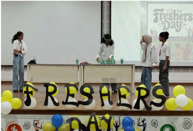
A fun filled moment from the Freshers' Day of Degree (HI) conducted on October 10, 2025.