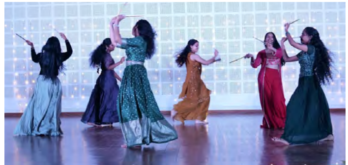
A snapshot of the Dandiya Night organized by the Students' Union on October 21, 2025.