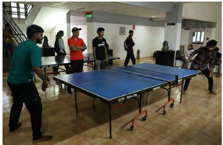
Students competing in the Intramural Sports Meet organized by the Department of Physical Education and the Students' Union in October, 2025.