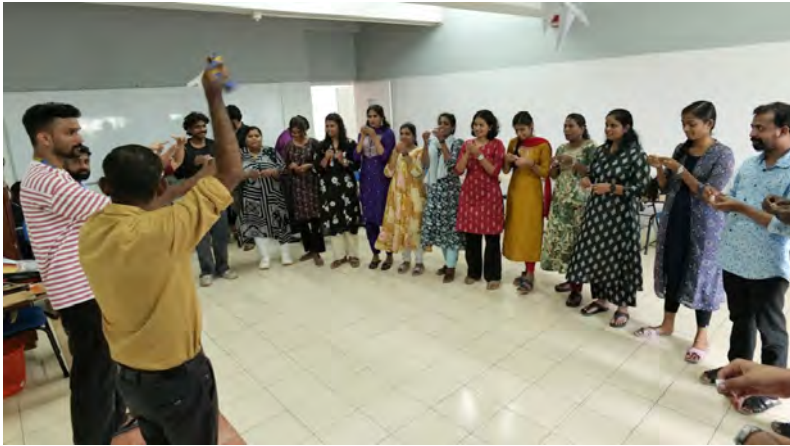
A glimpse of our new Diploma students actively engaging in their orientation journey at NISH.(October 27–29, 2025).