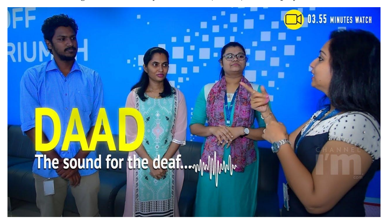
Digital Arts Academy for the Deaf (DAAD), a start up by deaf