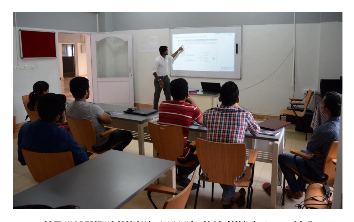
SOFTWARE TESTING SESSION by ALUMNI for S8 BSc [CS] [HI] - January 2017