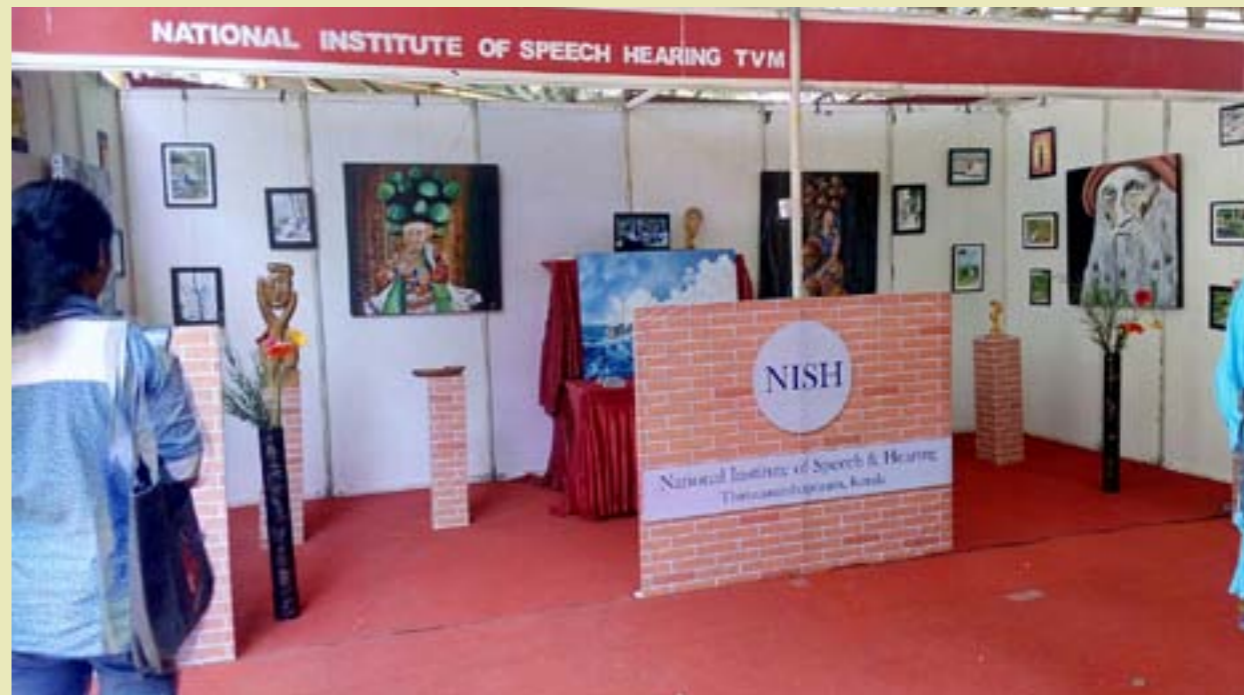
Pavilion of NISH in the All India Deaf Expo 2015 held from 17 th to 20 th December at Coimbatore.