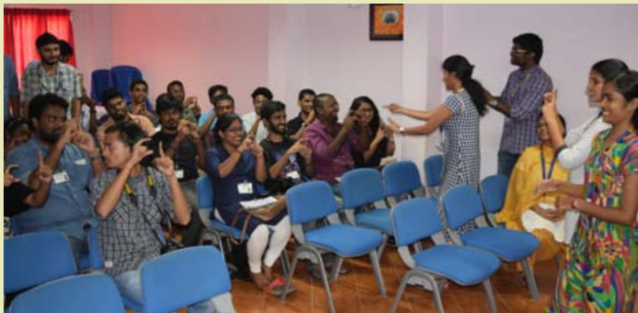
The journalism students from Mascom interacting with the Degree(HI) students of NISH.