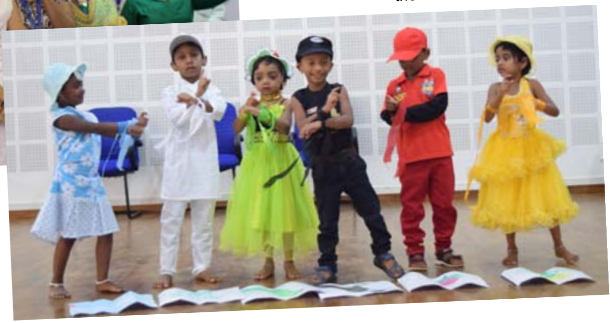
EIP students in action during their valedictory function