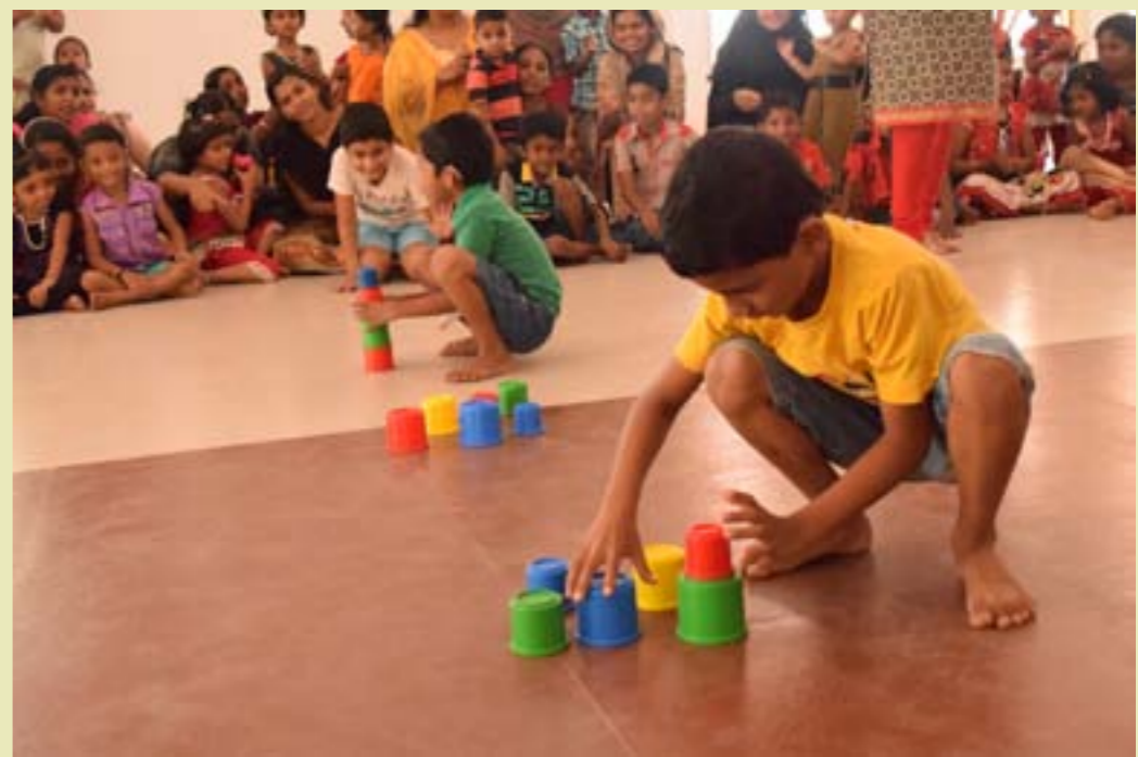
Children of Early Intervention Programme actively participating in the Sports Day organized by EIP Dept. on March 18, 2016.