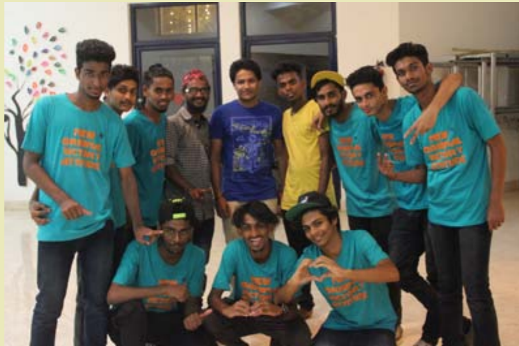
Winners of Aawaaz, Inter collegiate Fest of AIISH, Mysore