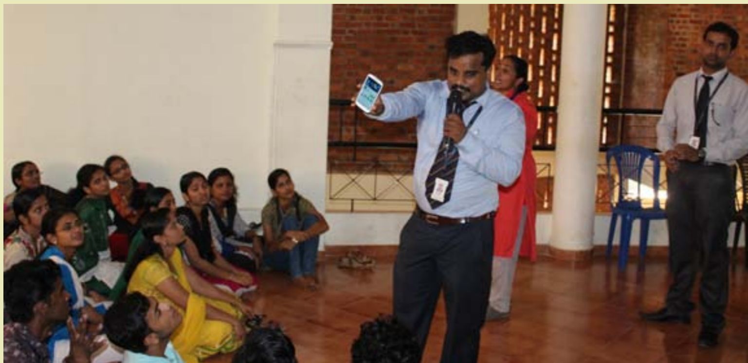
The UST - Global Mentoring team visited NISH on January 22, 2016 to create awareness on using iSafe, a Thiruvananthapuram city police mobile application among the students