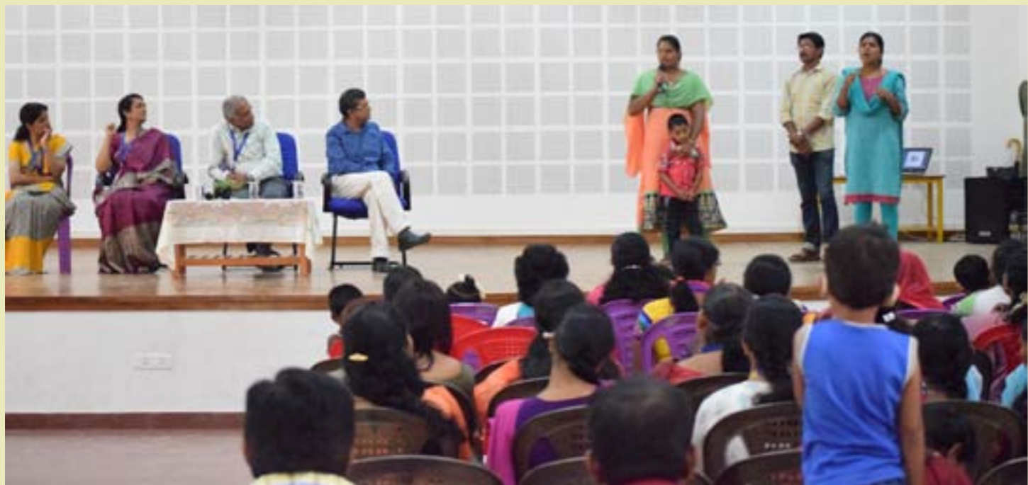
Parents sharing their experience during the farewell function of Early Intervention Programme conducted on March 28, 2016. 11 pre-school kids joined the mainstream schools this year