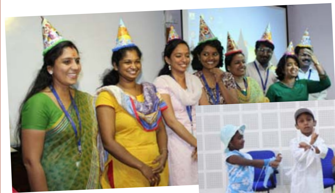
Birthday Celebration of NISHians