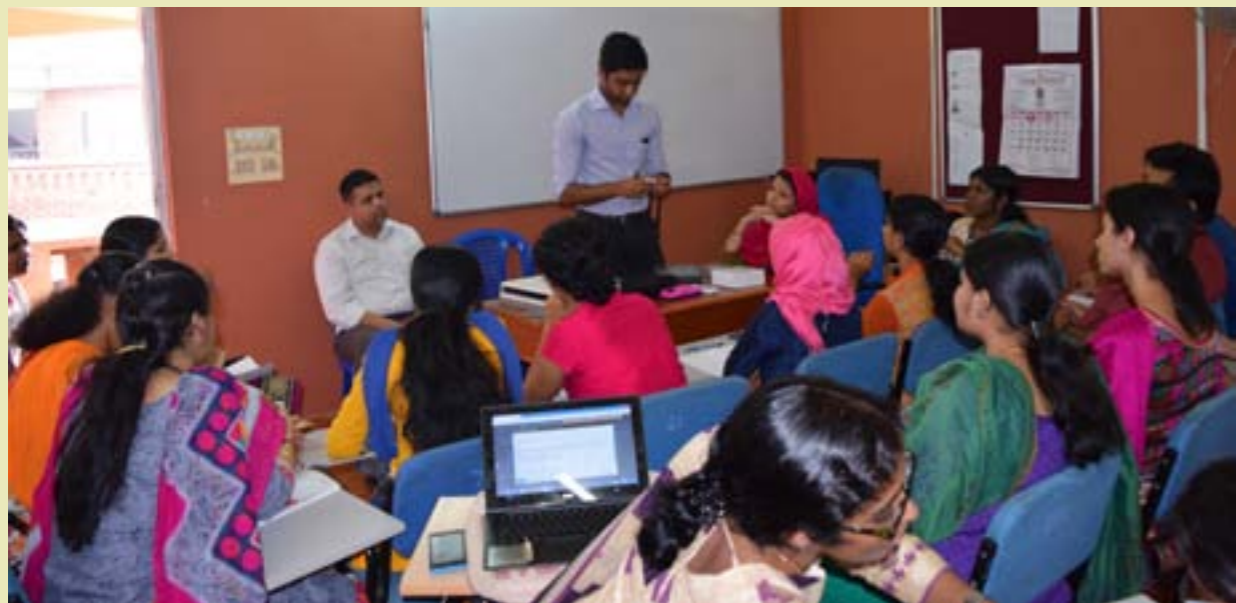
A session of the 3 day Training Program conducted by Medel Corporation from 27 th to 29 th January, 2016 at NISH.