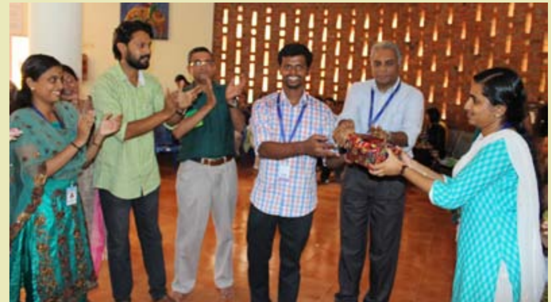
NISH staff exchanging gifts during the New Year celebration.

The EIP department at NISH successfully organized an awareness programme on hearing impairment for teachers in mainstream schools on December 19, 2015.