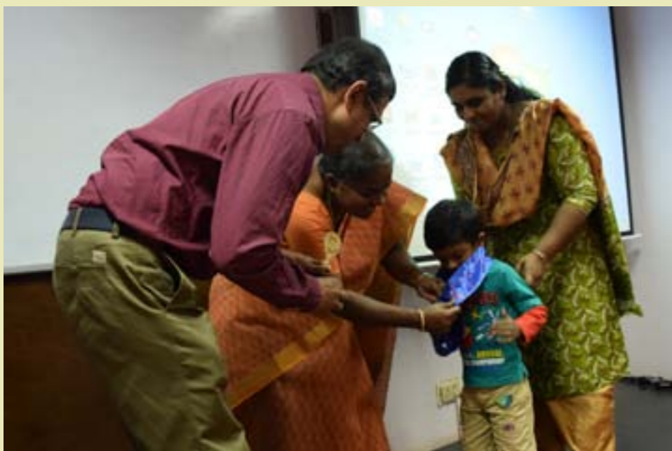
Third passing out ceremony of little stars of Neuro Developmental Sciences (NDS).